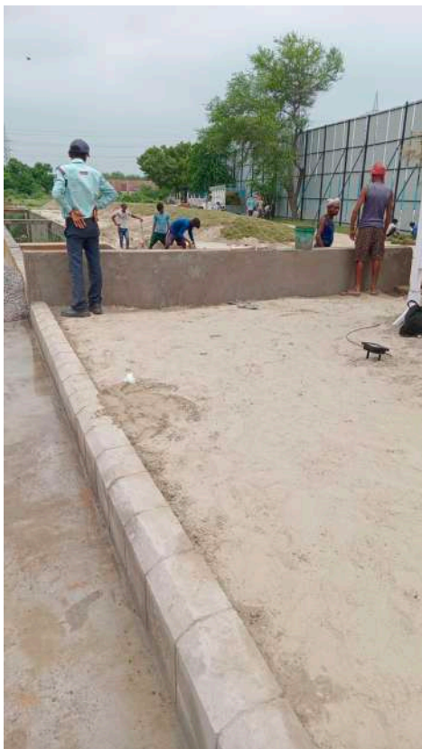
Main Gate Cobble Stone