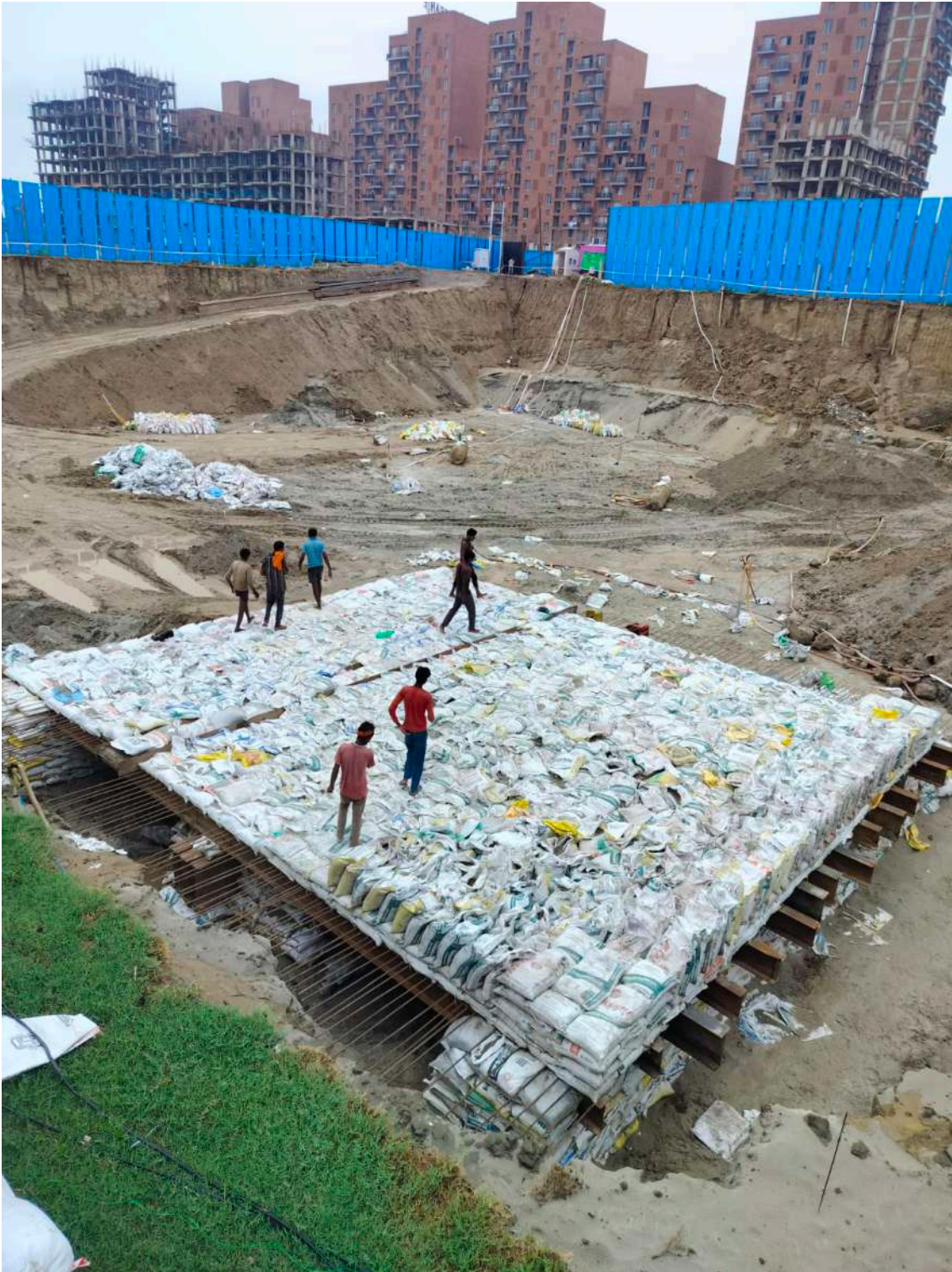
Pile Testing Work