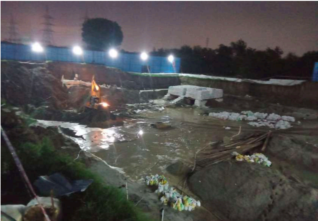
Pile Testing Work